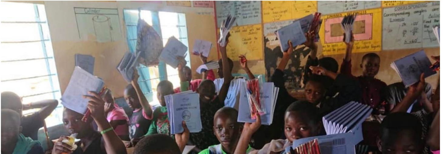
The kids proudly showing off their new school supplies.