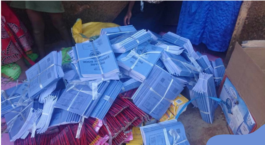
600 Exercise Workbooks. Each child received 8-10 workbooks.