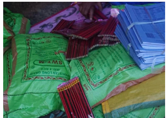
(right) Rice (green bags) and Beans (yellow bags).