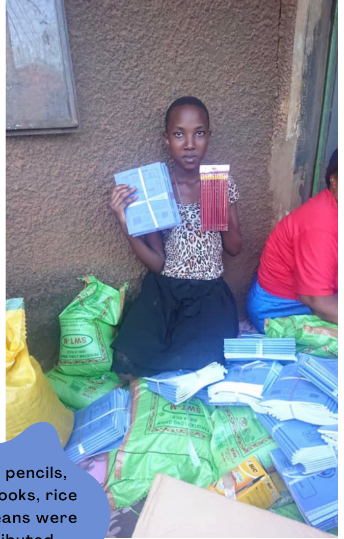
Pens, pencils, workbooks, rice and beans were distributed.