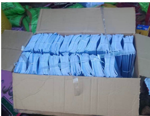
(left) Part of the Exercise Workbooks shipment.