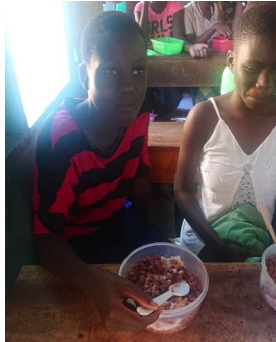
The kids enjoying a hearty meal of beans and rice.